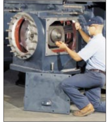
Dresser-Rand continues to offer a full-range of instructor-led courses and workshops

Dresser-Rand's web-based training curriculum, now available through Coastal, includes 24 in-depth courses for reciprocating products (19 courses), steam products (three courses),