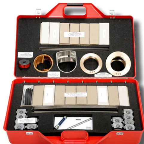
..... ■ Steam turbine kit box

Dresser-Rand also offers a convenient steam turbine kit box that is customized with the appropriate vital parts for each steam turbine. Ask your D-R representative for more information.